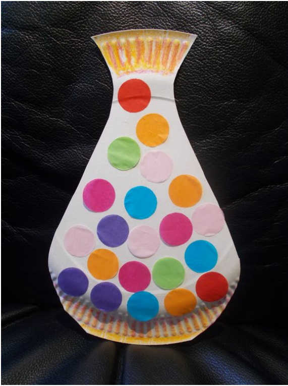
Make a paper plate perfume bottle

Grab an old bottle of perfume or some essential oils and guess the scent